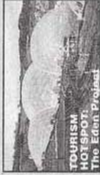
TOURISM HOTSPOT: The Eden Project

it is easy to see why. Property in this part of the UK commands a staggering premium thanks to the beautiful countryside, coastline and the UK's warmest weather.